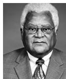
REV. JAMES M. LAWSON, JR.